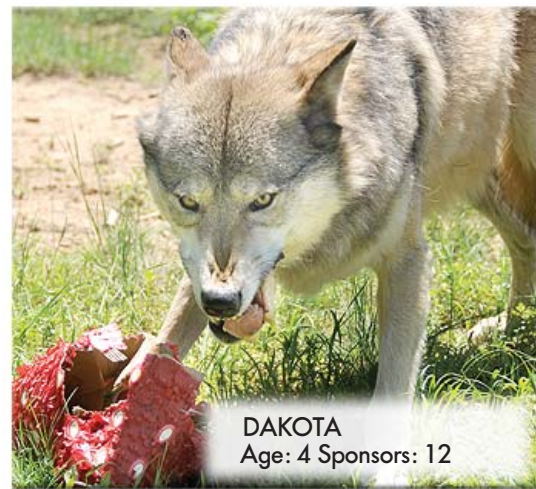
DAKOTA Age: 4 Sponsors: 12