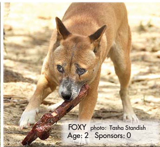
FOXY photo: Tasha Standish Age: 2 Sponsors: 0