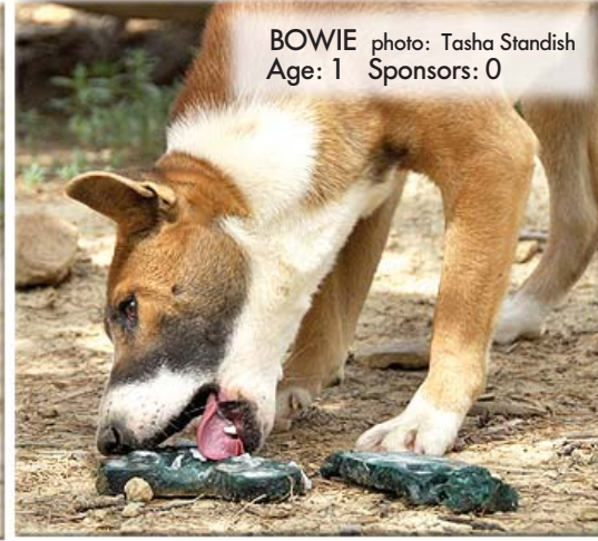
BOWIE Age: 1 Sponsors: 0