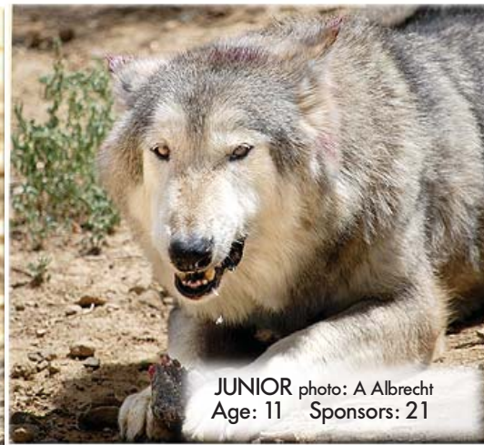
JUNIOR Age: 11 Sponsors: 21