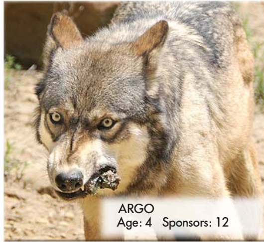
ARGO Age: 4 Sponsors: 12