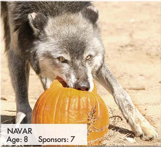
NAVAR Age: 8 Sponsors: 7