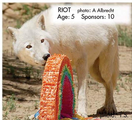
RIOT photo: A Albrecht Age: 5 Sponsors: 10