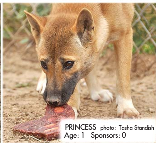
PRINCESS photo: Tasha Standish Age: 1 Sponsors: 0