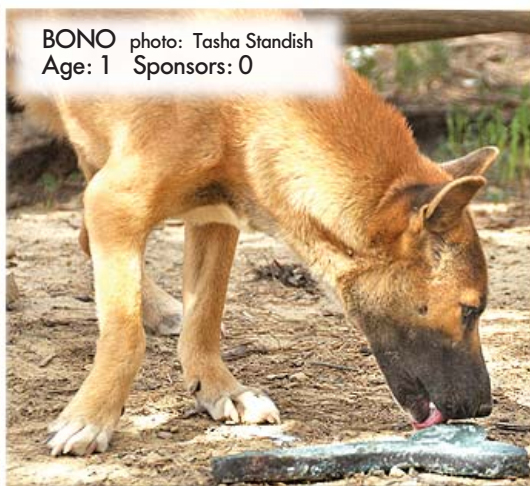
BONO photo: Tasha Standish Age: 1 Sponsors: 0