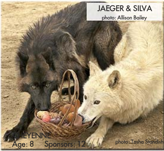
JAEGER & SILVA