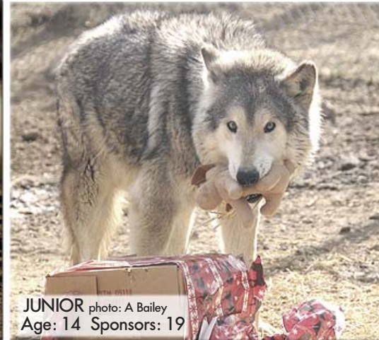
JUNIOR photo: A Bailey Age: 14 Sponsors: 19