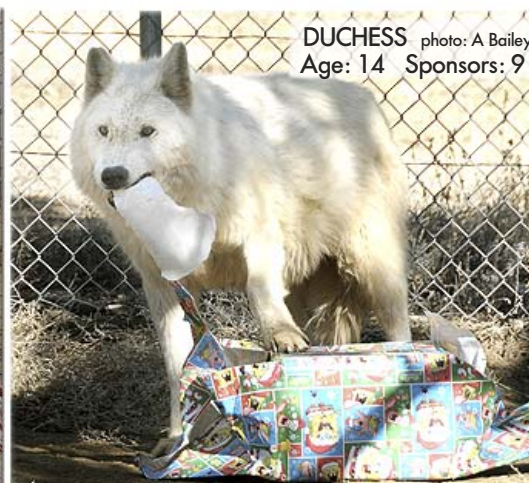
DUCHESS Age: 14 Sponsors: 9