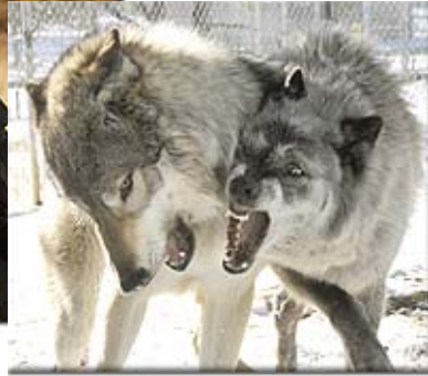
Zoerro & Contessa

to be reckoned with and I'm getting trained on (making friends with) other wolves and wolf mixes in our Sanctuary.