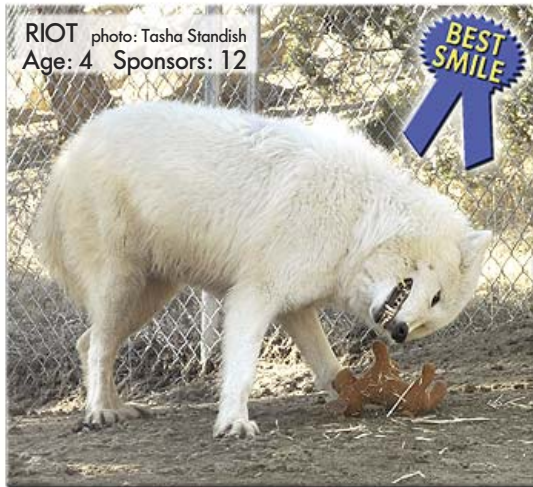
RIOT photo: Tasha Standish Age: 4 Sponsors: 12