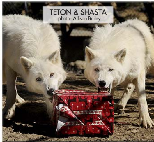
TETON & SHASTA