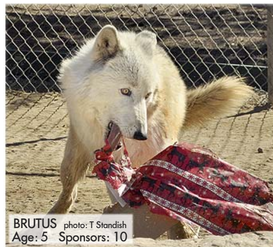
BRUTUS Age: 5 Sponsors: 10