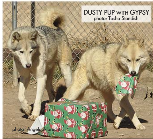
DUSTY PUP WITH GYPSY