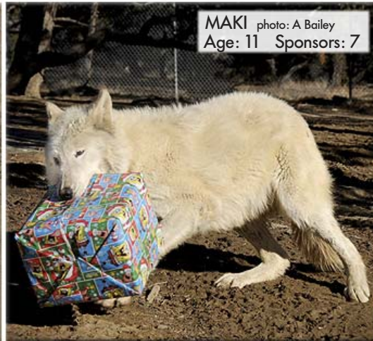
MAKI photo: A Bailey Age: 11 Sponsors: 7