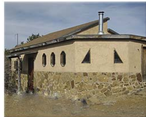
Future Ed Center

We feel that the one thing we do best at our Sanctuary is animal care. From the highest quality diet to vet care, our wolves are treated better than most animals at any zoo or sanctuary. Our dream is to reach toward creating the highest quality habitats that we can provide. We envision all of them undergoing extreme make-overs with beautiful and diverse landscaping, ponds and cave houses. Having a body of water in all the habitats will offer cooling pleasures for our animals and enrichment for those wolves who love to swim or just take a