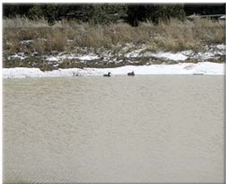
Ducks on Raven's Pond in March

educational center where school groups and other guests can come for classroom-type seminars as well as being able to offer other extended learning programs that we can host with guest speakers and educators. We want to put in additional parking lots that will allow more cars and even school buses. We will be able to expand our educational outreach so that we can impact a greater volume of humans who we feel need to understand the plight of the wolf.