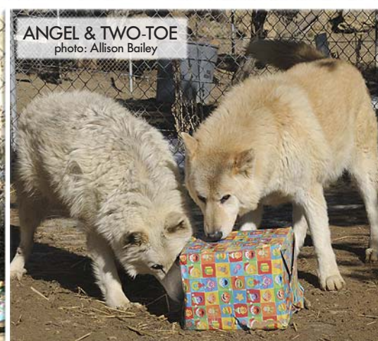
ANGEL & TWO-TOE