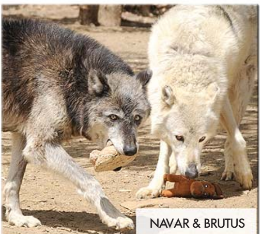
NAVAR & BRUTUS