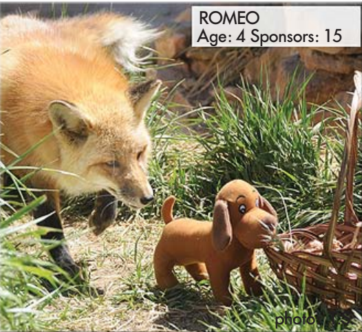
ROMEO Age: 4 Sponsors: 15