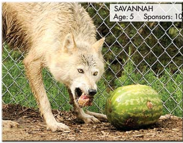
SAVANNAH Age: 5 Sponsors: 10

SUMMER COOLERS -SUMMER FUND-RAISING PARTY We work diligently to make each day at our Sanctuary a good one for our furry residents. Beyond providing superior care all year, we like to enrich Sanctuary life with four festive days of just plain fun. And you're invited! We're passing out Summer Coolers August 6 th and 7 th . The festivities are possible thanks to your donations. Each quarter, we ask you to send a $35 donation, either using the envelope provided, or with an on-line credit card donation, or give us a call with your credit card number. Your $35 donation, or whatever you can spare, keeps us going throughout the quarter and ensures that our rescued wolves and wolf-dogs thrive and our education efforts continue.