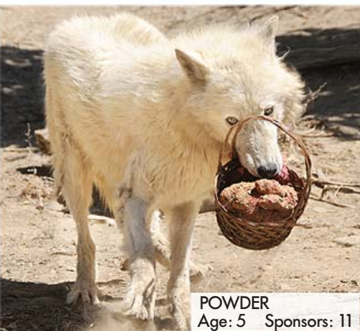
POWDER Age: 5 Sponsors: 11