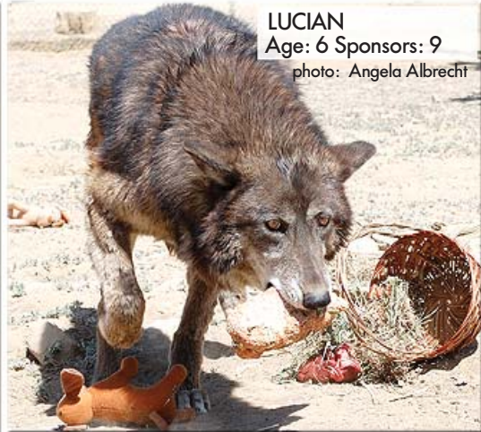
LUCIAN Age: 6 Sponsors: 9