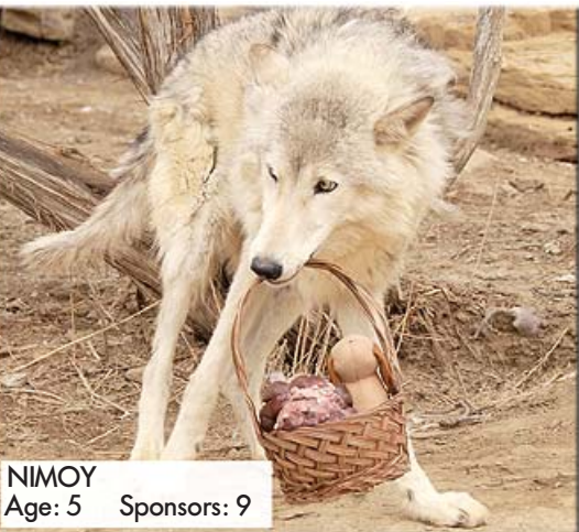
NIMOY Age: 5 Sponsors: 9