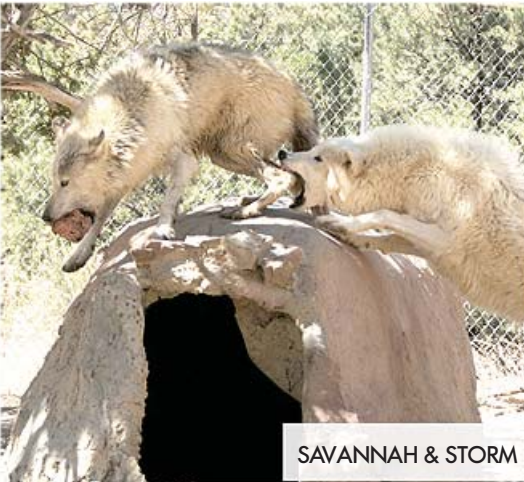
SAVANNAH & STORM