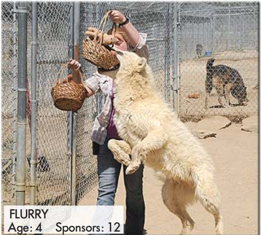
FLURRY Age: 4 Sponsors: 12